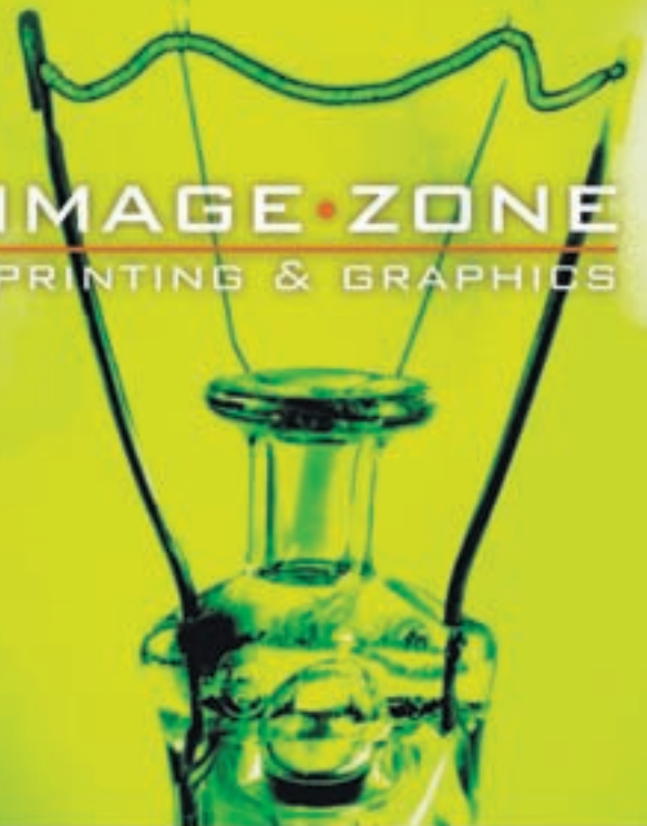
IMAGE ZONE PRINTING & GRAPHICS

If you do not have print ready files we can also help you put together a beautiful package that will fit your budget, everything done promptly in-house to accommodate your deadlines. Call us today to discuss your graphic design and printing needs.