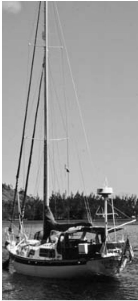
Right: Their sailboat, Tomorrow, at anchor at Todo Santos Island in Ensenada Bay, Mexico.